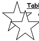
Table Top Sale A chance to clear out your cupboards before Christmas Sunday 27 th November 9.00am to 1pm Set up from 8.00am £5.00 (own table) £6 (inc. table hire). There is limited

NEW DATE: The Beer Festival will NOW take place in November- Friday 11 TH - "Open Mic" night, Beer, Bar and Bacon Butties, Saturday the 12 th - live music from "The Hot Dogs", BBQ and Bouncy Castle - something for all the family. There will be a chance to try some of the different beers available at the real ale bar whilst enjoying the music. There will also be an ordinary bar and a Pimms bar for those not so keen on real ale!